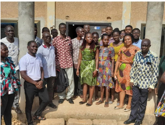
Teachers at Anum Apapam, one of the participating school districts

The All Children Reading (ACR) program aims at improving literacy levels and reading with upper primary school pupils in 40 schools in the Suhum-Ayensuano Districts. It also aims at reducing absenteeism and increasing time on task for the literacy hour among teachers in the target schools. It discourages verbal abuse and physical punishment of children, thereby creating a child friendly teaching environment. Participatory methods of language instruction and alternative disciplinary practices are also encouraged so that children engage positively in the learning experience.