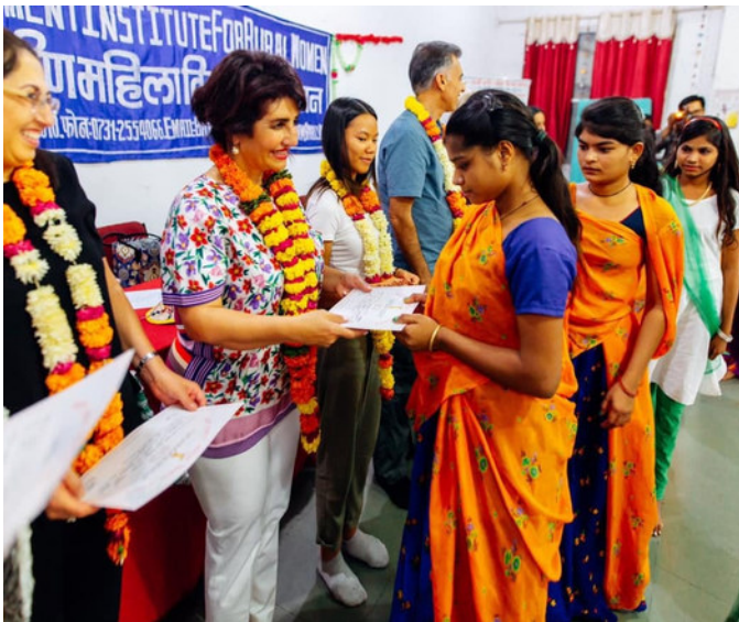
Graduates receiving their diplomas

The goal of Barli Development Institute for Rural Women is to build sustainable community development through the empowerment of young rural and tribal women. Founded in 1985, the Institute has trained over 15,000 women from 840 villages, impacting and improving the lives of thousands more. Their program is based on a six-month residential program that focuses on empowering women by training them in literacy, vocational skills, health and hygiene, environmental conservation and organic farming. The training programs promote gender equality and focus on education and health. This has created significant positive change among the trainees and their communities. Many of the participants arrive at Barli too shy to introduce themselves but, within six months, become skilled advocates for themselves. Upon return to their hometowns the graduates embark on community service, conducting literacy classes for other women, and children's classes. In 2022, 60% of graduates started their own businesses after returning to their village. With your help in 2022, Barli Institute received a grant of $21,695 CAD. This covered the program and training costs for 130 trainees. In addition, due to the smaller number of trainees in 2021, resulting in unspent funds, it was decided to allocate the surplus to a pilot project training rural communities in solar cooking. Funds received also purchased a small tractor to be used in the campus of Barli and an automatic sewing machine.