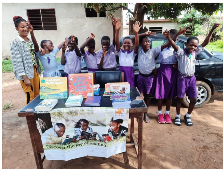
Children expressing the joy of Reading

Reading clubs with supplementary reading materials and peer assisted learning helps solidify gains