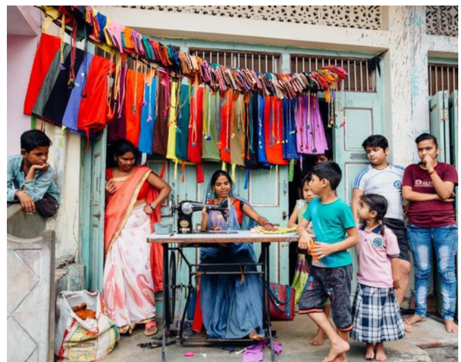
60% of graduates started their own businesses after returning home